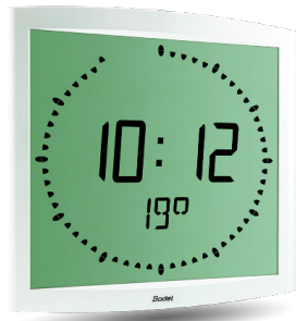
LCD Digital Clocks